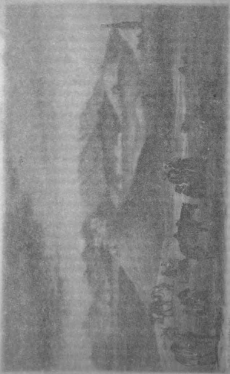
CHEZNI FROM THE SOUTH WEST.

Photographed by Smith-Barrow & Co. 65, Cornhill, London, E.C. 4.