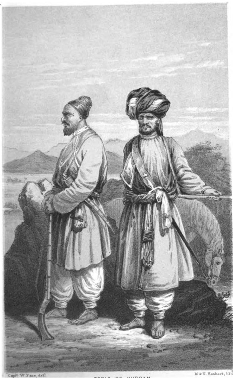
TORIS OF KURRAM.

Published by Smith, Elder & Co. 65, Cornhill, London, 1867.